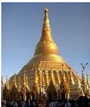
Photo stop at the Karaweik Hall royal floating barge. But nothing will prepare you for Shwedagon Pagoda, with its glittering gold stupa. At the pagoda, observe local pilgrims and monks offering their devotions and enjoy the amazing sunset view at Shwedagon pagoda. It will be a day with a lot of photo opportunities and perfect introduction to Myanmar.

Drive through downtown to explore the city center and its fabulous mix of architecture and sites. The streets are filled with historical buildings many of which have a faded colonial charm not seen elsewhere in Asia. You'll start at the post office – a lovely historic building- and to Sule Paya in the middle of downtown, passing by Strand Hotel, Mahabandoola Garden and Independence Monument along the way. Then visit Little India and Chinatown.